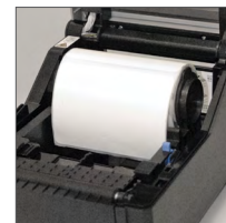
Drop-Load-Go Media Bin