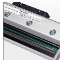
Easy Print Head Replacement